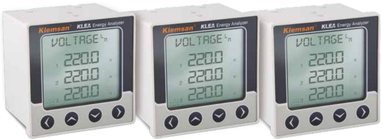
KLEA 220P Energy Analyzer